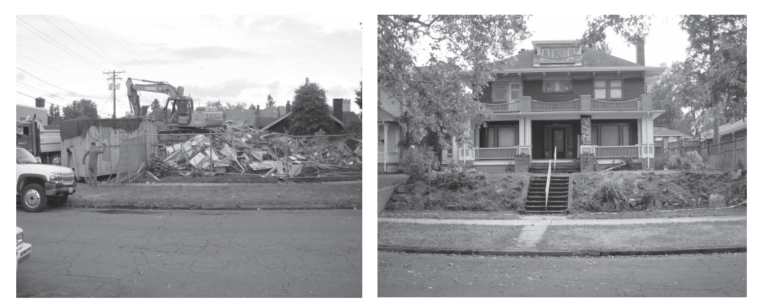
Contrast the demolition with the restoration just a few blocks away. The 1907 Colonial Revival is in the NSHD and is being restored, proving that "Where Yesterday Meets Today," can work.

ou may have noticed the demolition of a house at 223 N. J. St. The 200-block of J. St. is not in NSHD because in 1994 only one property owner wanted into the District. So, the City left the block out of NSHD. The block is included in the National District, but there is no protection against demolition for the National Register. The block was also excluded from the new single-family zoning category, HMR-SRD, (completed in Dec. 2006), because the new zoning was to follow the boundary lines of the City's NSHD. A large apartment is rumored to be built since zoning is R-4.