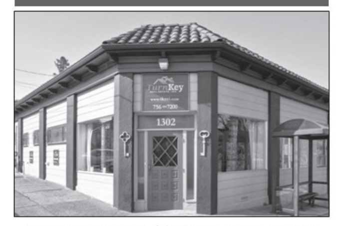
1302 N I Street Tacoma, WA 98403 www.tkrei.com

HEAR THE REAL ESTATE MARKET'S PAST, PRESENT, & COMING YEAR PROJECTIONS! 8. WHAT SELLERS NEED TO DO TO PREPARE THEIR HOME FOR SALE!